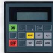
The DPC features a user-friendly push-button interface putting you in complete control.